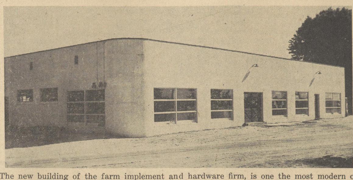
The new building of the farm implement and hardware firm, is one the most modern of its kind on the peninsula. The success of this firm is particularly outstanding when one a basket with some grain. Two realizes that it is based in the somnolent hamlet of Burrsville.