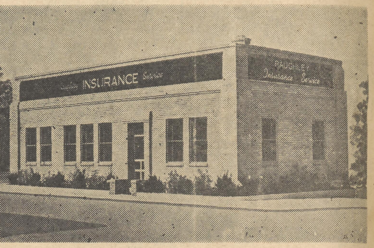
We Stand Between You And Loss