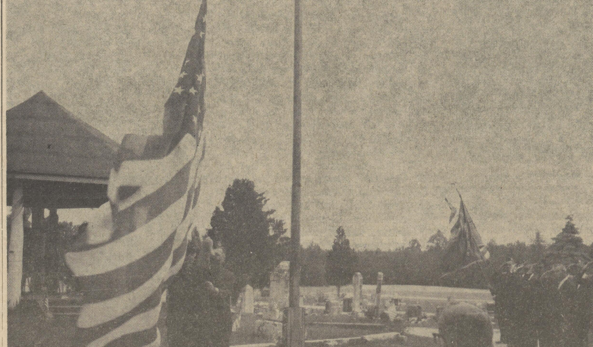
HONORING THE DEAD — Scene at the Hollywood Cemetery, Harrington, during the administration's bond request. Memorial Day Services held there Monday.