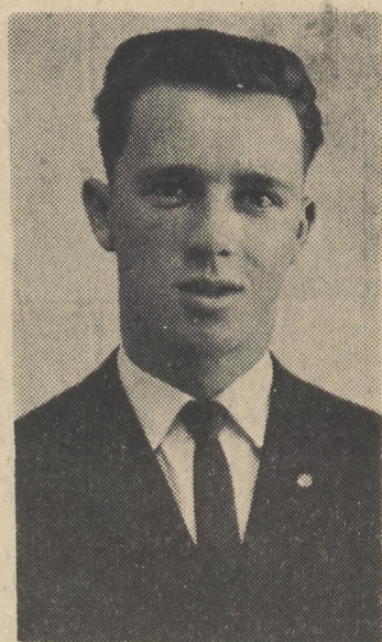
Daniel J. Smith H. S. Music Student to Tour Europe

Services were held Monday afternoon at the Berry Funeral Home in Felton, where Masonic services were held Sunday night. Burial was in Barratt's Chapel Cemetery.