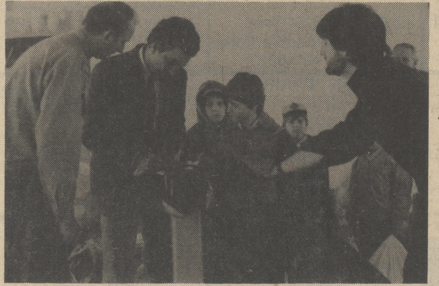
"Can a Cub to Camp Rodney" - Cub Scouts in Felton's Pack 141 have been waiting since September to get all those aluminum cans out of their closets and garages, from under their beds or wherever. Saturday was their big chance as they participated in the grand opening of the Reynolds Aluminum Recycling Center in Dover. They turned in 641 pounds of aluminum and netted $154.74 towards camp. [For details see "Felton/Sandtown News" on pages 5 & 8.]

on the proposed one acre per lot requirement for septic tanks. Zimmerman pointed out that under the proposed regulations a 100 acre lot could be sub-divided for 100 homeowner lots and still leave land available for farming or other use. Zimmerman made mention of the fact that 45% of the septic tanks in Frankford/Dagaboro failed inspection. Wilson stated that most residents are cooperating with the Department, but that some homeowners had to be taken to Justice of the Peace Court. It was pointed out that the Department of Health has found that 51 public water systems have a nitrate content in excess of acceptable standards. Conaway thanked the DNR & EC for holding so many public meetings before adopting any new regulations.